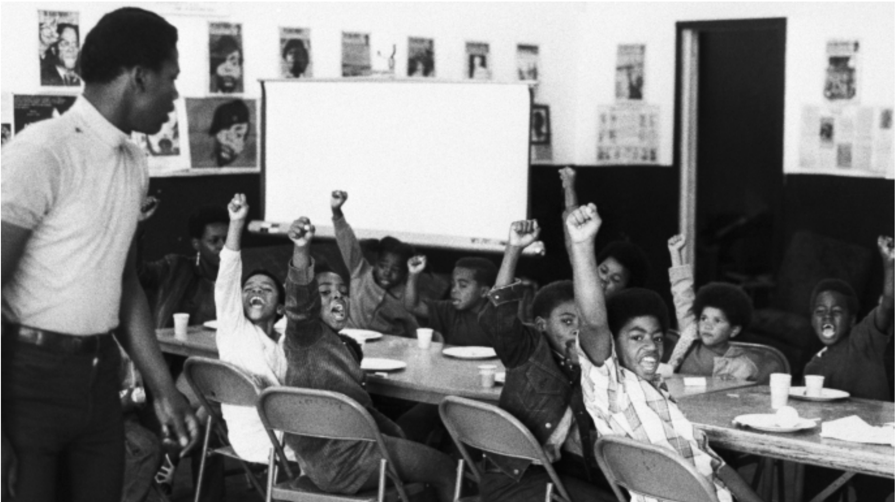
A teacher and his at a Black Panther liberation school.

In 1969, a group of children sat down to a free breakfast before school. On the menu: chocolate milk, eggs, meat, cereal and fresh oranges. The scene wouldn't be out of place in a school cafeteria these days—but the federal government wasn't